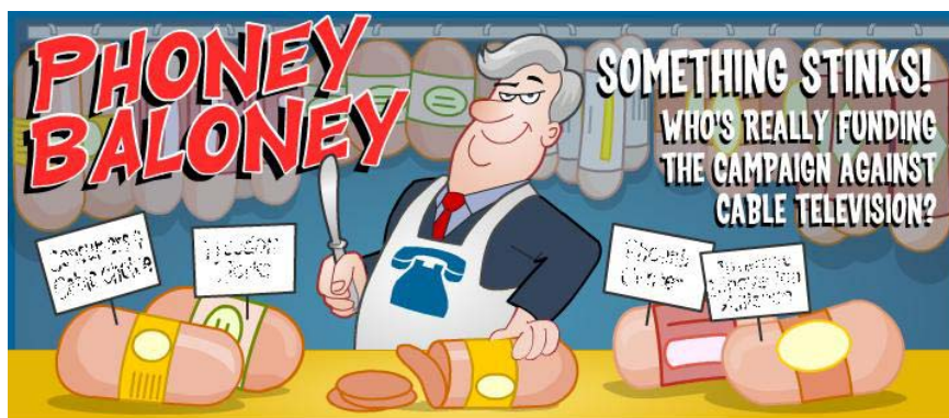
The group that runs this website accusing phone companies of being “full of baloney,” is affiliated with Keep It Local New Jersey, itself an Astroturf organization.

The cable companies, obviously, want to protect their local monopolies. They say changing the law would be the equivalent of giving phone companies a special deal. 49 So they’ve launched Keep It Local NJ – an Astroturf campaign designed to give the illusion of grassroots support for the cable industry’s position. 50